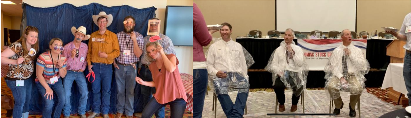
Left: YPA members pose for photobooth at Mini-Carnival Fundraiser. Right: WSGA/YPA Leadership get ready for a pie in the face.